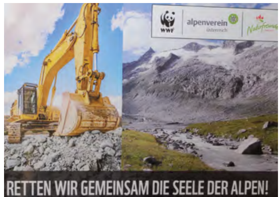
Protection of unspoiled nature.

www.unsere-alpen.org www.seele-der-alpen.at