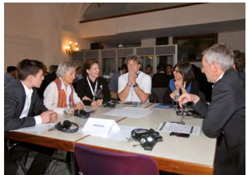
Discussion at the English-speaking table.