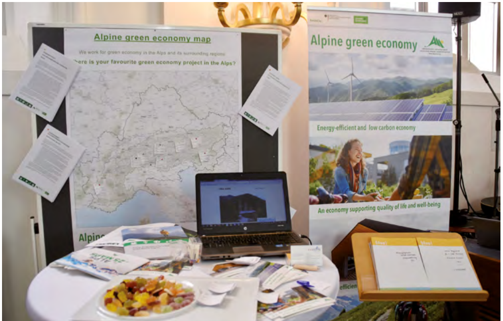
Market stall of the Green Economy Project.

www.alpconv.org/fileadmin/user_upload/publikationen/green-economy-action-programme_2019.pdf